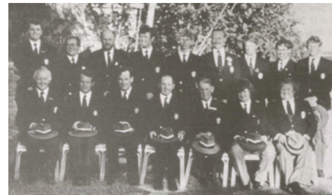
1978, GB Rifle team

Transport seems to have been an "entertaining" theme. Flights for the tour with BA were only, eventually, confirmed two days before departure, following a strike announced by BWIA three weeks earlier. 34 rifles and the shooting kit were packed into four fibreboard boxes, which the captain had made himself, for transportation. The rifles were then taken from the team on arrival and secured in a locked armoury for the duration of the stay in Jamaica (a practice we still expect to encounter on this year's tour), and the team was loaned a police coach – a contrast to later in the tour, when transport to Paragon Range in Barbados was by a combination of taxis and Mini Mokes!!