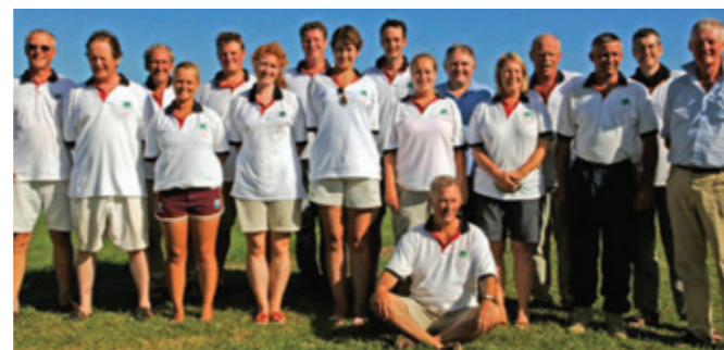
2006, NRA Goodwill team

A few things have changed over the course of these tours – airlines, ranges, security, hairstyles... and there are no more of those 1980 light blue blazers! But it sounds like the good shooting, company, hospitality and beauty of the venues remain.