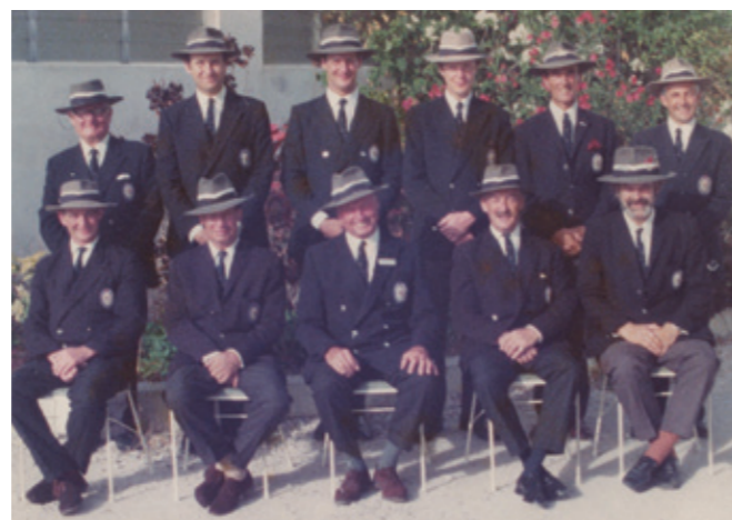
1973, GB Goodwill team

The very start of that report offered some anachronisms – the team flew with BOAC, and were looked after in the VIP lounge with rum punch provided while luggage cleared customs in Trinidad. Next up: a cocktail party given by the Deputy British High Commissioner. La Seiva Range – another anachronism, sadly - was described as high on a plateau with a view of the Venezuelan coast, with a natural stop butt of tropical trees and vegetation, a single firing point with clubhouse and drinks nearby, and targets at different positions for each distance on the other side of a ravine. The wind blew back off a hill so that