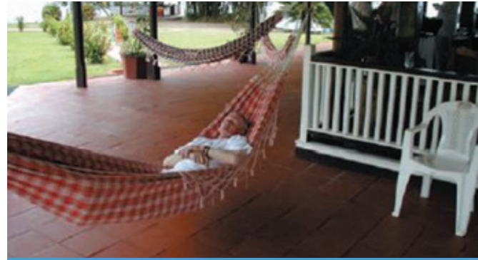
The Main Coach ready for the match