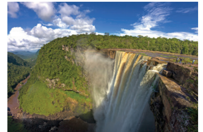
Kaieteur Falls, Guyana

“AN AIRBOURNE SIGHTSEEING TOUR & A VISIT TO THE STUNNING KAIETEUR FALLS”